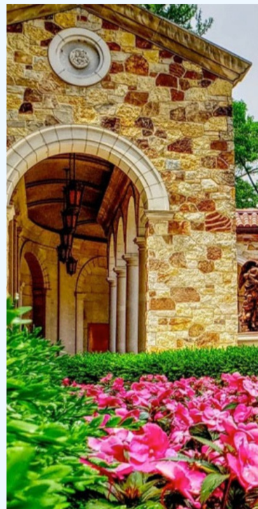
Our Lady of Guadalupe Shrine