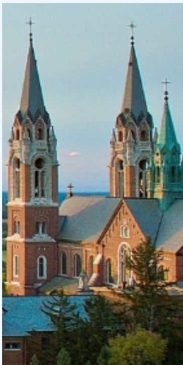
Holy Hill Shrine