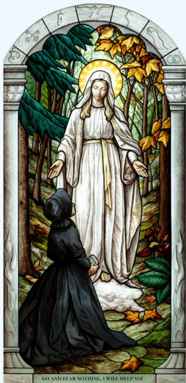
Our Lady of Champion Shrine