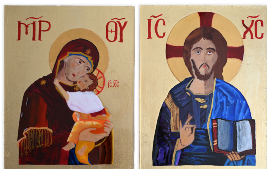
THE VIRGIN OF TENDERNESS AND THE PANTOCRATOR (20" X 14" EACH)