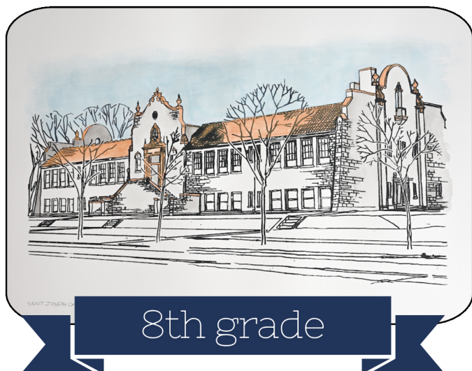
SAINT JOSEPH CATHOLIC SCHOOL: ARCHITECTURAL SILKSCREEN PRINT (24" X 28" FRAMED)