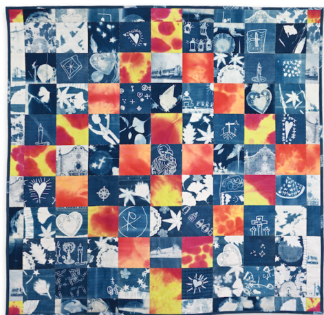
LIGHT: A HANGING QUILT (48" X 48")