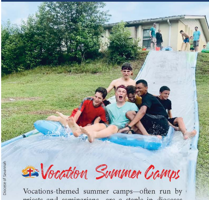
Diocese of Savannah

Religious brotherhood is a vocation that deserves renewed attention by the faithful and serious consideration from young men discerning God's call.