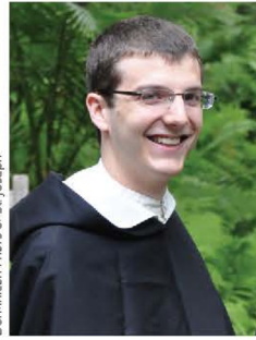
Dominican Friars of St. Joseph

With today's shortage of priests, one might assume that any man entering a religious community would naturally go on to be ordained. Historically, however, this has never been the case. Religious life—marked by the vows of poverty, chastity, and obedience—has always been recognized as a vocation in its own right, distinct from Holy Orders.