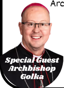
Special Guest Archbishop Golka

Good food, live music, fun games! School history displays & building tours Archbishop remarks & photo-op